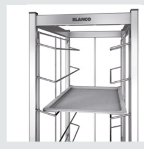
Optional: An additional push-through protection at the back keeps trays securely in position.