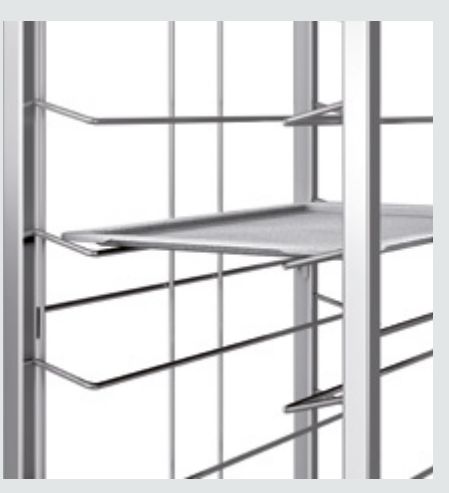
Stainless-steel tray supports with integrated push-through protection on both sides. The tray support frames can be completely removed.