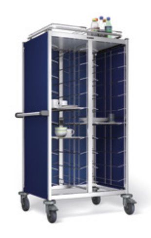
TAW 2 x 10 GN with stainless-steel trolley top, all-round railing and push handle (shown with accessories)