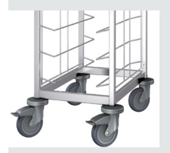
The stainless-steel frame construction is securely welded and therefore offers the highest levels of stability.