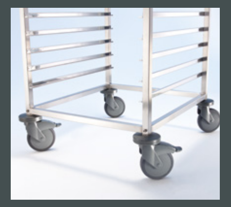
All-round stability The robust, all-round base frame adds extra stability while also protecting the support rail against deformation.

BLANCO shelf trolleys: long operating life featured as standard.