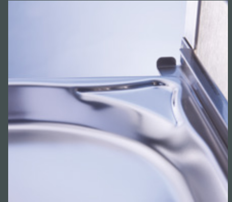
Also safe during transport The push-through protection is mounted on both sides and thus ensures safe transport in every direction.