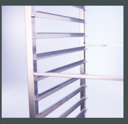
Connected crosswise Cross struts increase the overall stability. Thanks to their offset arrangement, they can also be used as support rails.