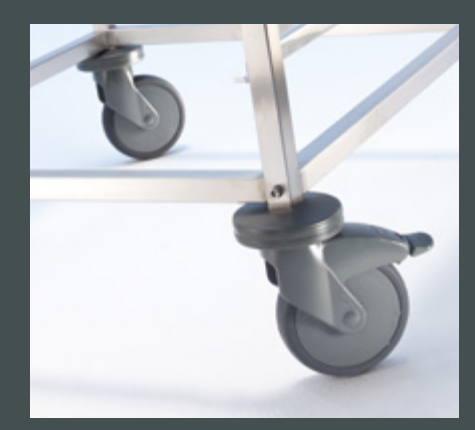
Bumper rail fitted as standard All shelf trolleys are equipped with a strong bumper rail. They protect the trolley and inventory against damage.