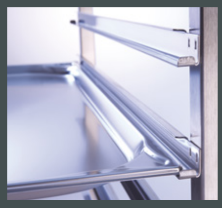
Safety first The special U-profile of the support rails acts as an integrated tip safety device.